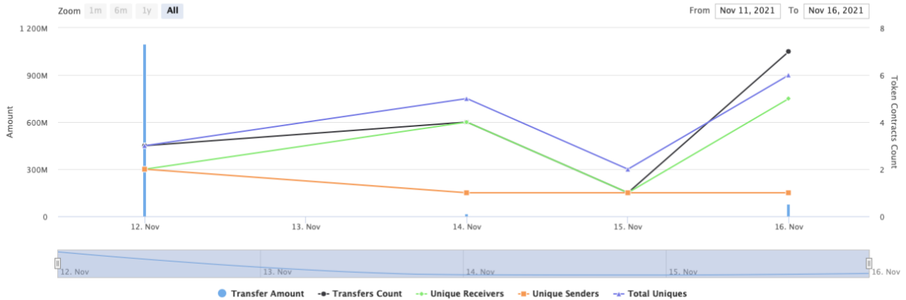
Token Contract 0xdc53cc373e888525c30946424de8cf0baffcbe62 (COLECT) Source: BscScan.com